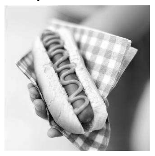
Prepared by Iowa Food Safety Task Force June 2010